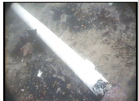
9. Completed Underwater Repair.