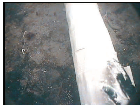
8. Top Coat with Splashbond.