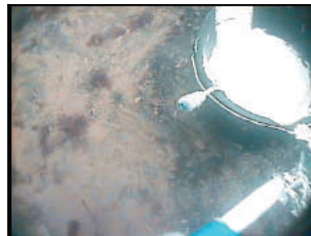
5. Use knife to open pouch.