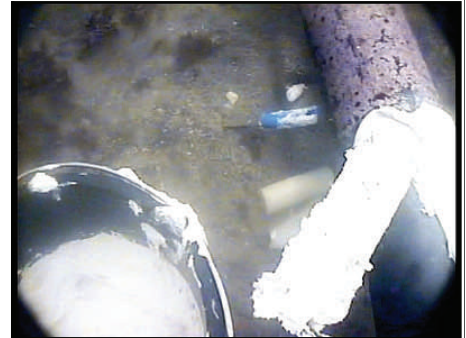
3. Use Trowel to apply Splashbond onto pipe.