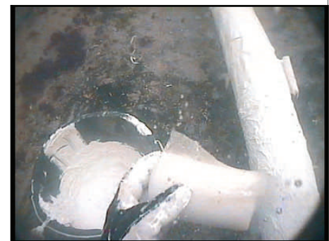
6. Splashwrap is activated by surrounding ocean water.