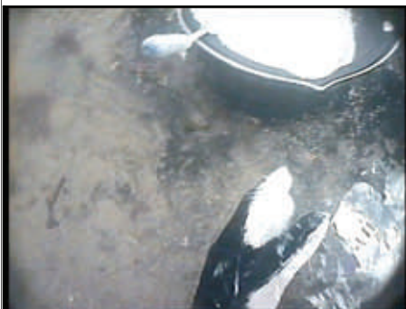
4. Grab Roll of Splashwrap.