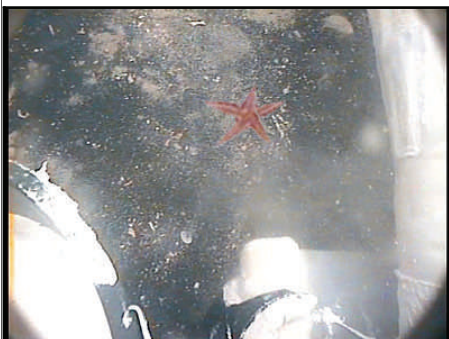
7. Wrap pipe quickly.